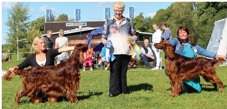
Premie Dubliner Alejandro R-Premie Starmix Harley Davidson