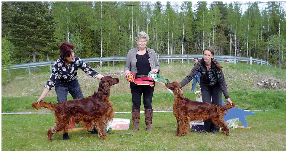
BIS Surprise For Dubliner Z Arislandu BIM SE V-13 CIE No V-15 Fairhaven Olivia Optimizer