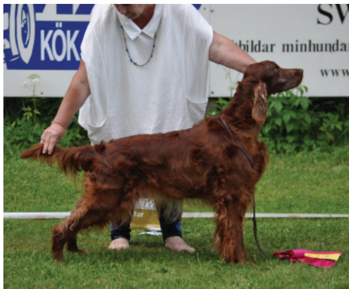
BIR Veteran Ashrim's Elf