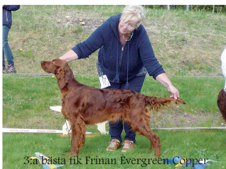
3:a bästa tik Frinan Evergreen Copper