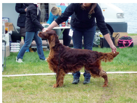
3:a bästa hane Copper's Pop The Bubble