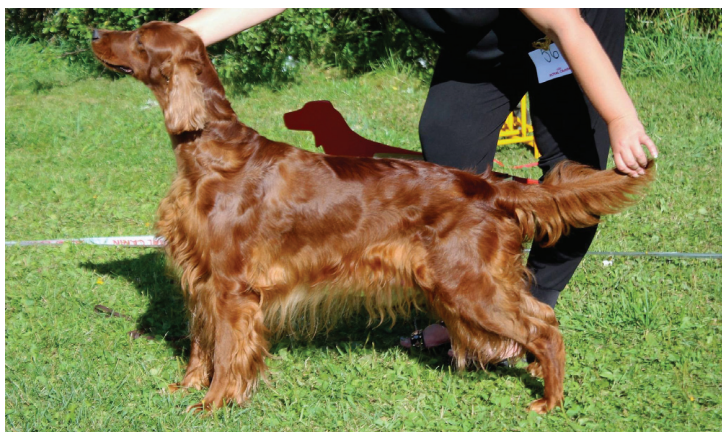
R-premie Fairhaven Opal Springs