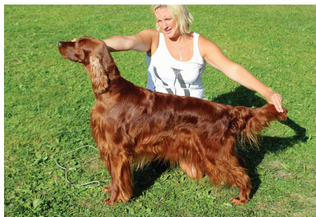
Discovery's Love At First Sight