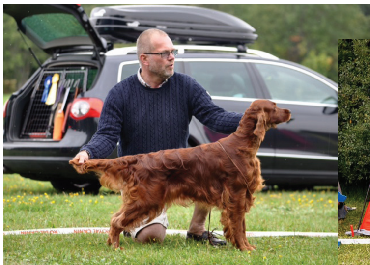
BIS Copper's Törnrosa