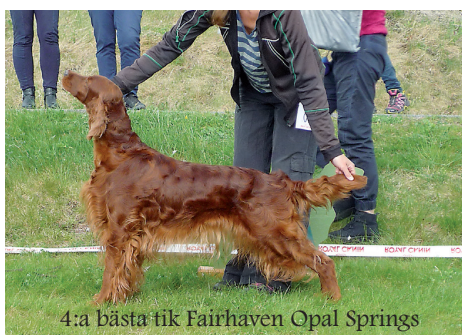
4:a bästa tik Fairhaven Opal Springs