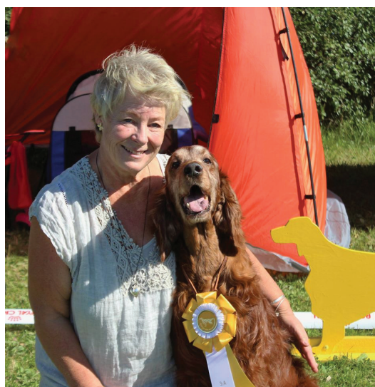
Bästa veteran Coppers Bubblande Glad

Thank-you to all at ISF for a most wonderful time and for having me to judge at your friendly & very well run show I loved every moment.