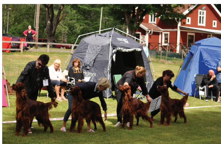
Ett gäng hanar i slyngelåldern (unghund)