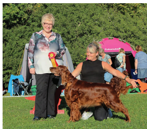
BIR-Senior Copper's Classic Bubble