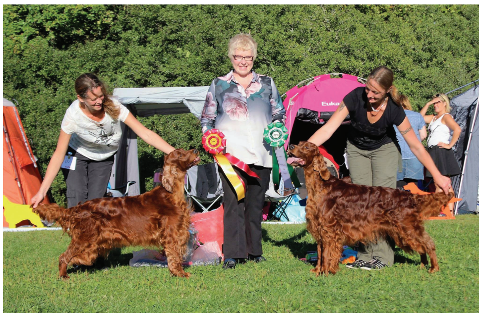
BIR C.I.E SE JV-12 -V15 Fairhaven Olivia Optimizer BIM Coppers Magical Mystery Tour

In August I had the great pleasure of judging Irish Setters at my first European appointment in Sweden, after the kind invitation from the ISF to judge there 40th Anniversary show in Vasteras, judging in Europe was something I had wanted to do for a long time.