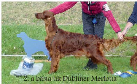
2:a bästa tik Dubliner Merlotta