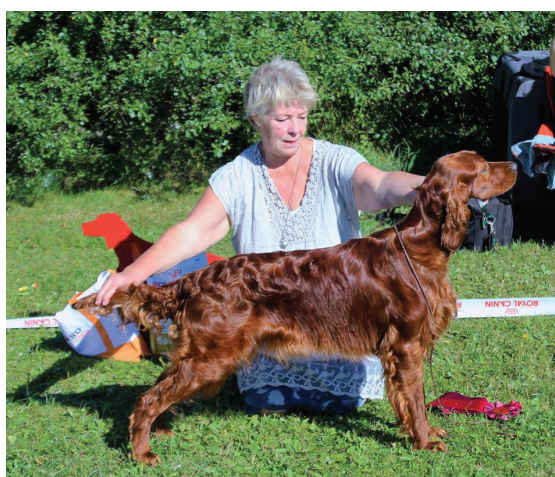
Frinan Evergreen Coppers