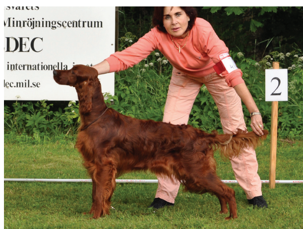
Premie tik: Dubliner Merlotta