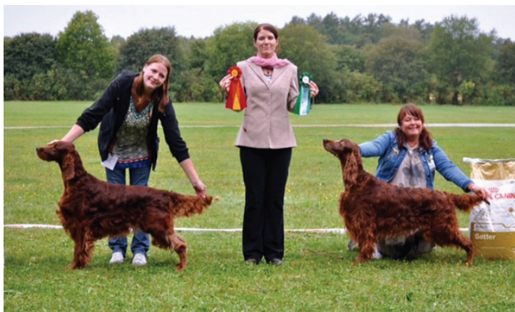
Seniorer Copper's BIR Pop The Bubble BIM Starmix Exotic After Ski