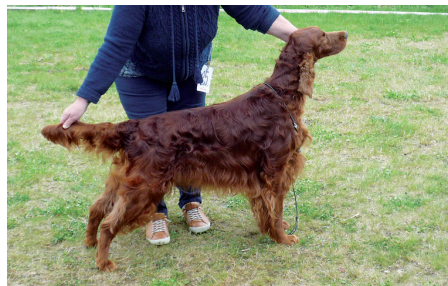
2:a bästa hane Copper's Magiska Under