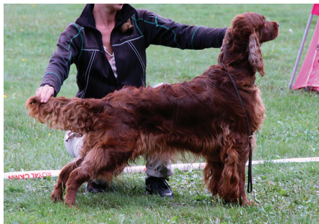
Premie tik: Fairhaven Twilight Saga