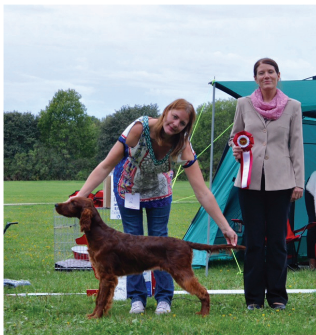
BIS valp Pawsword Paper Tiger