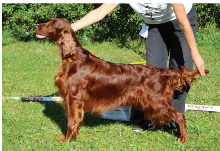
Öppen 1 vinnare Fairhaven Uniolista Collezioni