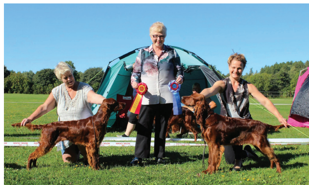
BIS valp Pawsword Paper Tiger BIR valp Gamekeeper Parabellum z Arislandu