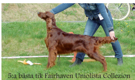
5:a bästa tik Fairhaven Uniolista Collezione