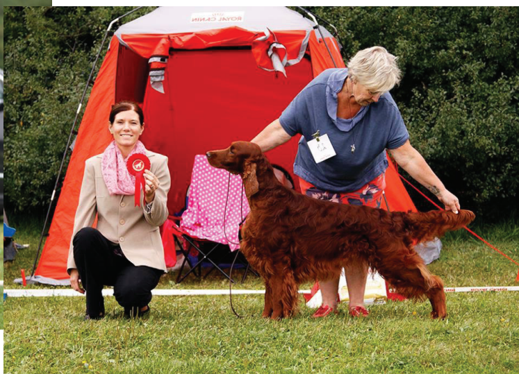
BIM GB SH CH SEV-13,14,15 CIE DKV-15 NORDV-15 Copper's Magiska Under

It was a very pleasant surprise that after 10 years the Swedish Irish Setter Club invited me to judge at their Club Show. I would like to say thank you and it really delighted me that they were curious to hear my opinion again. Furthermore I would like to say thank you to the entered dogs' owners that they honoured me with their participation.