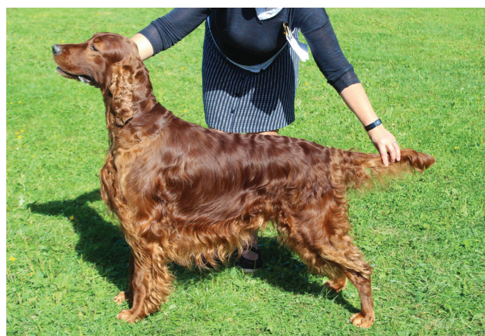
2:a premie hane Red Tails Jackson's Balthazar