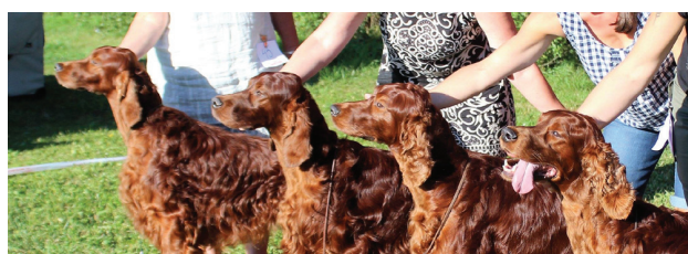
Bästa uppfödargrupp Copper's

Nu väntar spännande ISF utställningar 2017!