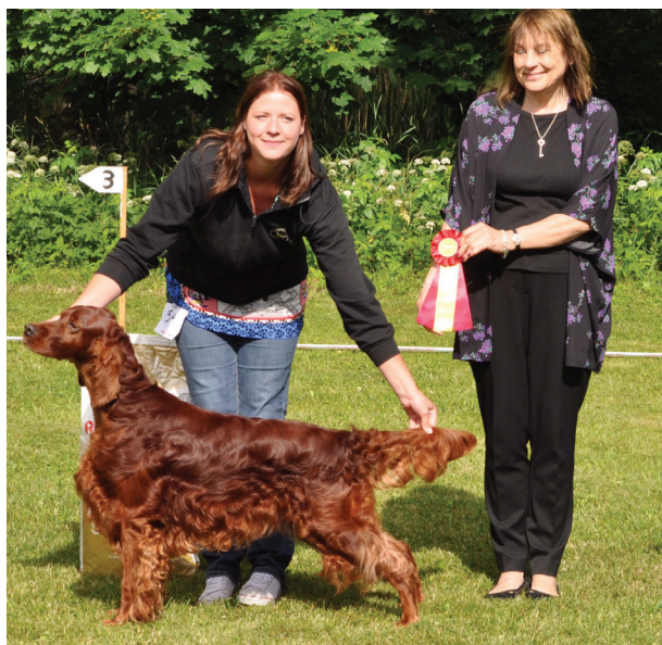
Premie hane: Copper's Pop The Bubble