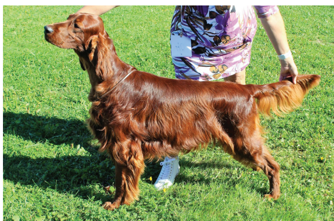
1:a juniorhane Blazing Bronze Disco Inferno