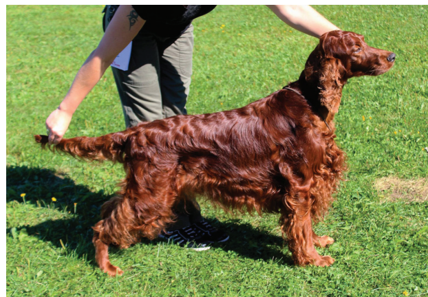
Premie hane: Copper's Wash'N'Go